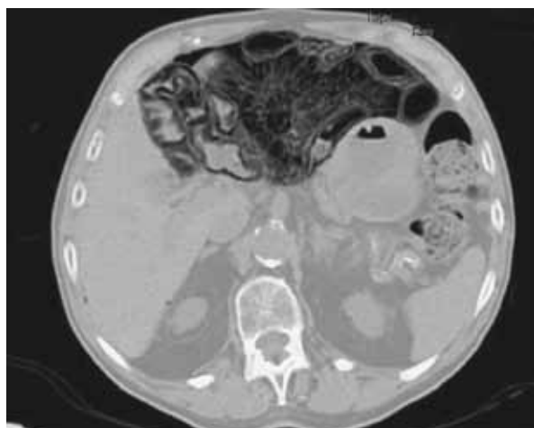
Figure 2 Abdominal CT scan

bowel loops. Diagnostic suspicion was established as cystic pneumatosis intestinalis. Given the acceptable general condition and age of the patient, conservative treatment was initiated using parenteral nutrition, broad-spectrum antibiotics (ceftriaxone and metronidazole) and respiratory support with high flow oxygen. The patient's evolution was satisfactory, with improvement of his digestive and general health. The programmed laparotomy was performed one week later, during which a cholecystectomy was performed and the intestinal loops examined.