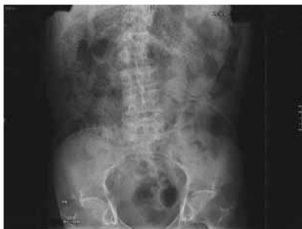
Figure 1 Abdominal X-ray

The X-ray (Fig. 1) and abdominal CT scan (Fig. 2) showed pneumoperitoneum on the perihepatic level as well as intramural gases in the adjacent small